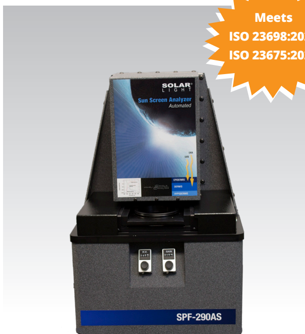
Solar Light - SPF-290AS ™

The SPF-290AS ™ simplifies complex SPF analysis with an easy-to-use, automated system that ensures reproducible results and minimizes operator variability. Its streamlined design allows R&D teams to focus on formulation optimization, reducing reliance on costly in vivo studies while lowering development costs and accelerating product innovation.