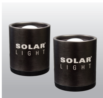
Included NIST-Traceable SUV & UVA Sensors