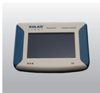
Included DCS-2 Automatic Dose Controller