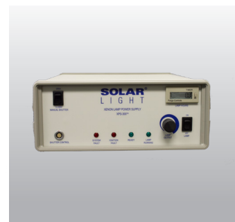
Included XPS-300 Xenon Lamp Power Supply